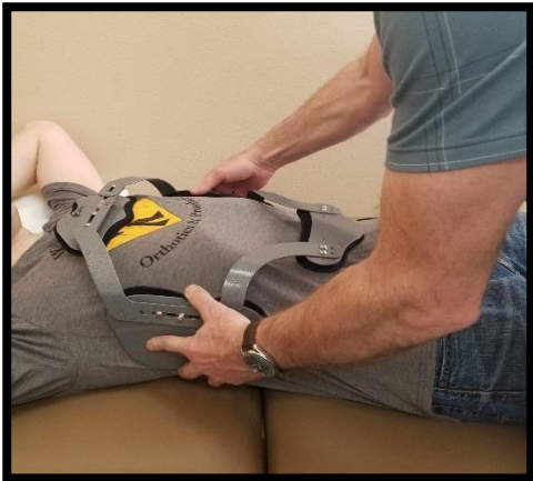
STEP 1: Apply front portion of brace centering it on torso

Confirm with referring MD regarding use and function