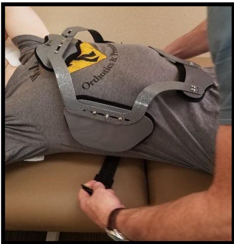
STEP 3: Pull "quick release buckle" so that strap can attach to post